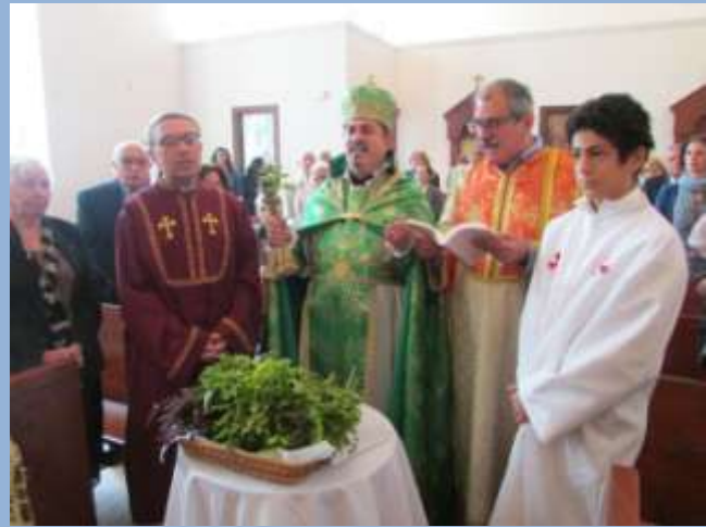
Blessing of the basil