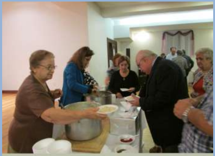
Serving of Madagh