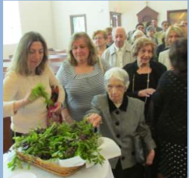
Faithful receives the blessed basil