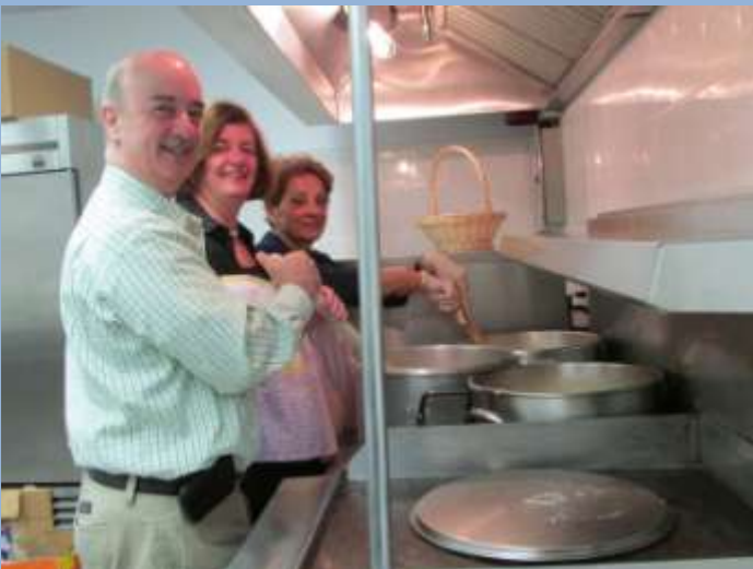
Preparation of Harissa